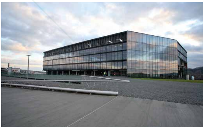
⌘ Kaunas Žalgiris arena –the largest one in the Baltic States. ⌘

Kaunas is a hotbed of Lithuanian cultural traditions and historical events. It is Lithuania's second city, according to its size and importance, of national, geographic and economic significance. In addition to being the city of old traditions, it is also a large science, business, industrial and cultural centre. Kaunas is open to friends and collaboration partners, and receptive to innovations and attractive investments.