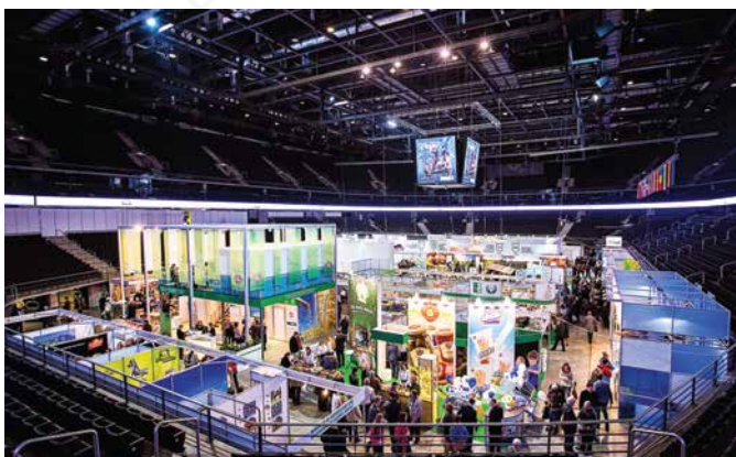
⌘ The exhibition „Made in Lithuania“. ⌘

Lithuanian products comply with the European Union quality standards, therefore they can successfully compete with products available from food and light industry markets all over the world.