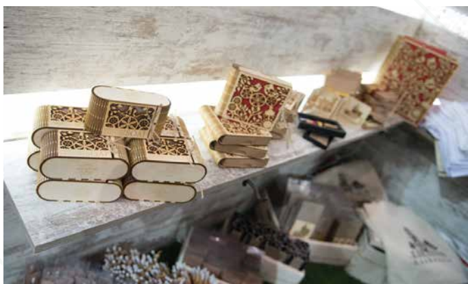
⌘ The exhibition „Made in Lithuania“. ⌘

Lithuanian products comply with the European Union quality standards, therefore they can successfully compete with products available from food and light industry markets all over the world.